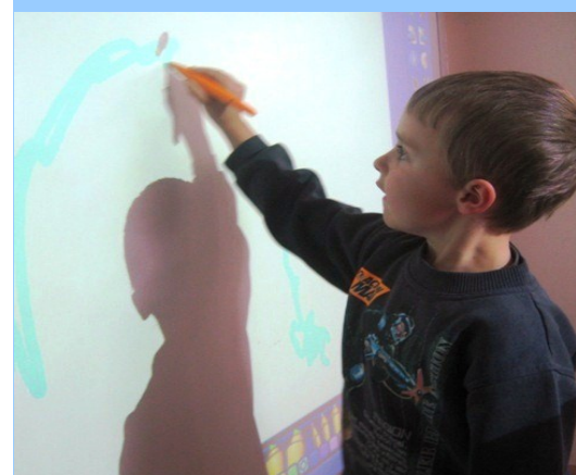
Using the electronic pen to draw