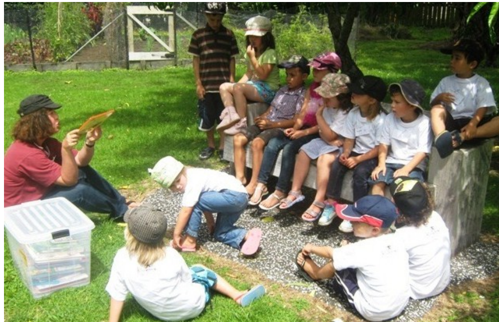
We stopped at the park to read our library books