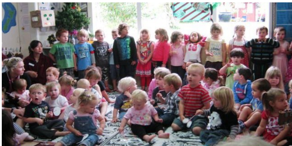
Tamariki performing at the concert. Ka pai!