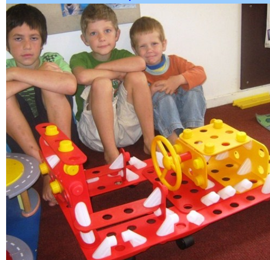
Look at the car we built!