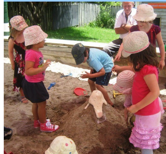
OSCAR children joined pre-schoolers to build a volcano in the sandpit