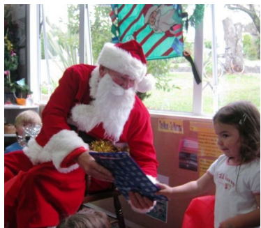
Oooh, a present from Santa!