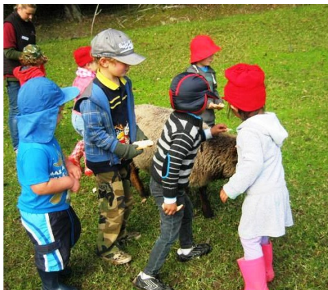
The sheep were very tame