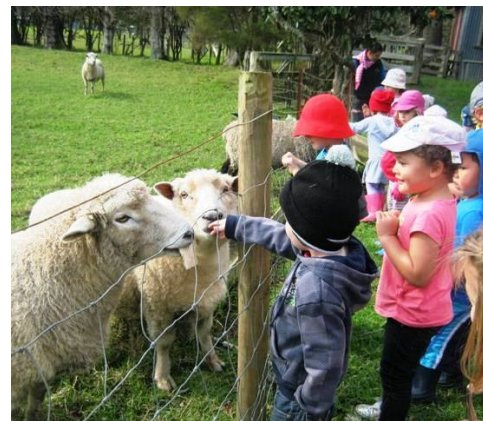
Tagen feeding the rams