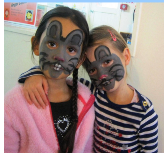
Brodie and Brooke are best rat friends!