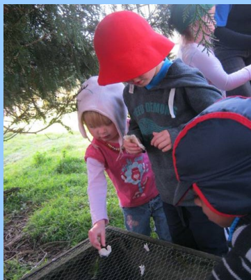
Feeding the hens