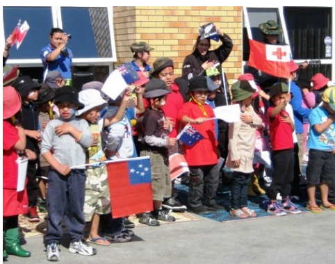
All lined up and ready to go