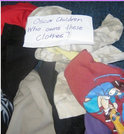
Lots of clothes need to go home to their owners

The third term has flown by and now the holidays are here again! Our holiday programme will see us out and about with ice-skating, art and crafts, table tennis, the movies and much more. There are limited spaces and it is essential to secure your child's place early. We have a number of unclaimed and unnamed clothing items which belong to our OSCAR kids but we have been getting questioning looks when asking who they belong to. It may pay to have a look in our lost property the next time you come to pick up your child. Named clothing has a much better chance of finding its way home and will save you money in the long run!