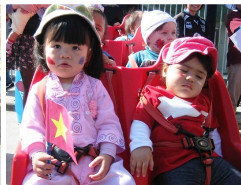
What a big morning we've had!