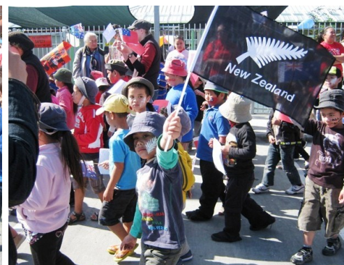
Waving our flags on parade