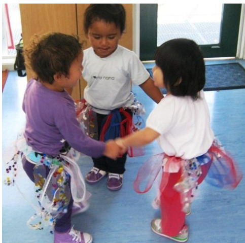
Playgroup mums made our skirts