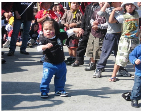
Doing the haka

★ No later than Tuesday 20th December, 2011, to between Monday 30th January, 2012, and Tuesday 7th February, 2012.