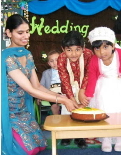
Indian prince and princess

The Mint House teachers and children went all out decorating their environment in preparation for their big celebration day. They made paper flowers and garlands, painted pictures and took ballroom dance classes. Closer to the day, the children became involved in preparing the feast. Groups of children helped their teachers prepare Chaklis (Muruuku) an Indian snack made from rice flour, stuffed rotis (parathas), seviyan (Kheer), laddoos and mini cupcakes. Another group worked with Avalina to bake the wedding cake and many hands went up when it was time to decorate it with icing! Others learnt how to make bread stuffing which was served with the hāngi style lunch. We have noticed that the kitchen equipment in the family play area is being well utilized recently. Written by Veena