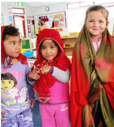
All dressed up for Eid