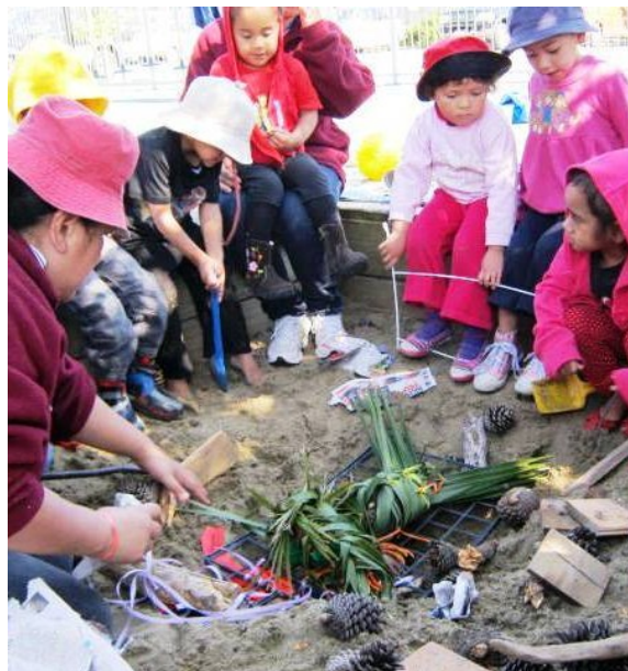
Our wonderful hāngi feast