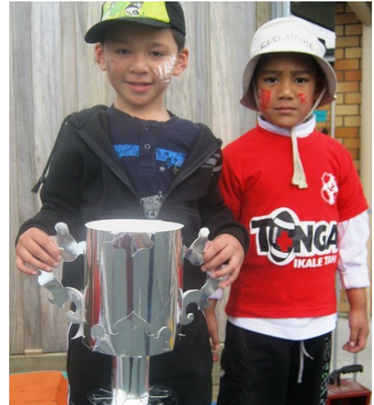
Our Webb Ellis cup